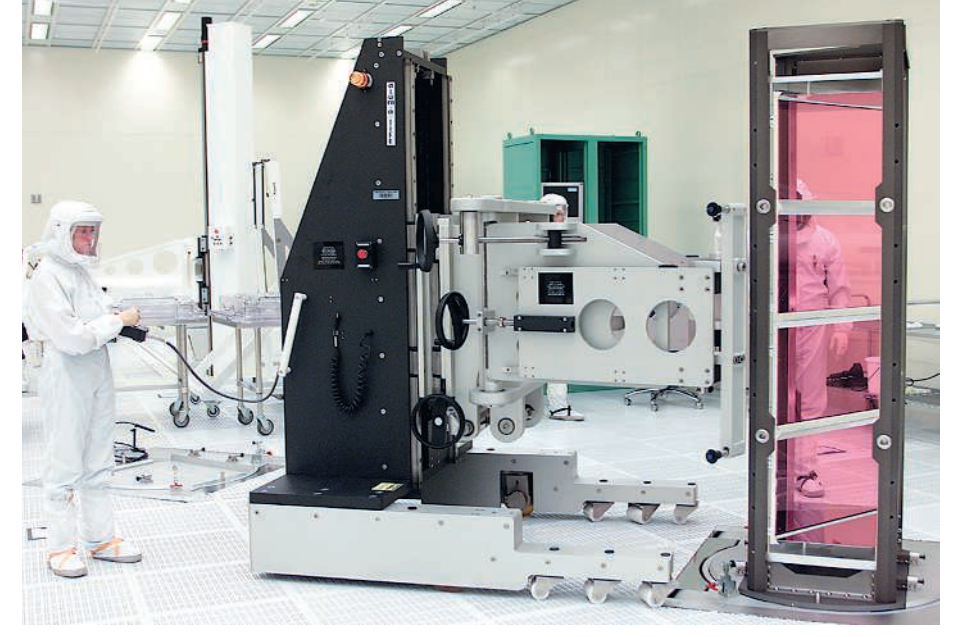
Clean machines. In conditions worthy of a semiconductor plant, technicians prepare a laser glass slab ( right ) for insertion into the beamline.

may be some flaw in the capsule or fuel layer. Even under ideal conditions, instabilities are inevitable, researchers say. The key to beating them is speed: "We need to do it fast enough so instabilities don't get big. It's extremely hot and high pressure. It wants to blow itself apart," Rosen says.