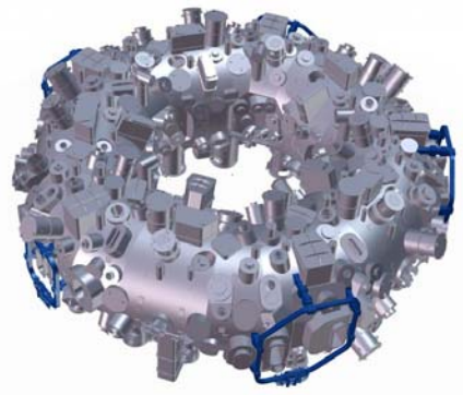
Figure 2: PPPL/ORNL are designing and building five normal-conducting trim coils , which will allow individual adjustment of the divertor heat patterns in the five modules of W7-X. Shown is a CAD drawing of the W7-X outer vacuum vessel, with attached trim coils (in blue).

The trim coil system (coils and power supplies) fills a mission- and time-critical need in the W7-X project. PPPL is leading this task, with strong involvement by ORNL. IPP has supplied coil and power supply technical specifications, magnetic load cases, space envelopes, and locations of all leads and coolant interfaces. The U.S. team has developed detailed designs and manufacturing drawings for the coils, performed structural and thermal hydraulic analyses, completed preliminary and final design reviews, and initiated procurement. The first two coils will be delivered to IPP in June, 2012. In conjunction with the control coil design activities, the U.S.-IPP team has updated the power supply technical specification. The U.S. team has begun design work on the power supplies, with the goal of manufacturing and delivering them to IPP by April, 2014, so as to be available to support W7-X commissioning activities. The budget for the coil project is $2.9M, and the preliminary estimate for the power supplies is $2.7M.