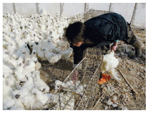
Drug habit . Chinese farmers routinely administered an antiviral drug to poultry, according to a news report.