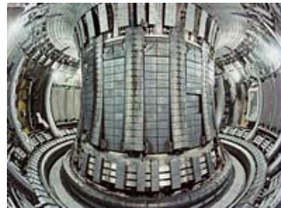
The world's most expensive doughnut, the tokamak

The vision behind ITER (International Thermonuclear Experimental Reactor), the 10-billion-dollar scheme which cleared its last political hurdle on Tuesday, is of a world where energy will be cheap, clean, safe and almost infinite.