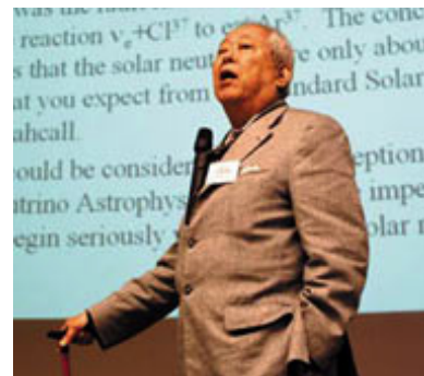
Nobel Prize winner Masatoshi Koshiba is sceptical about the reactor

That compares with ITER's goal of producing sustained pulses of 400-500 megawatts of electricity from 40 MW of heating power.