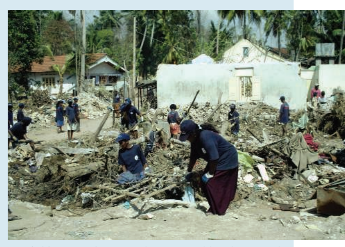
Don't blame God. Better planning could make natural disasters much less disastrous, experts say.

Even with greatly enhanced warning systems and infrastructure, natural disasters will continue to wreak enormous damages. Who will pay for it? After the past year's $200 billion in damages from weather-related disasters alone-three times higher than for any previous year—some economists are calling for a radical rethink of disaster relief. Rather than relying on the fickle charity of the international community, countries should invest in a new kind of disaster insurance that trans-