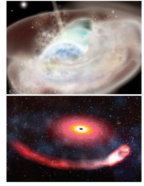
Flash points. Collisions between neutron stars ( top ) or a neutron star and a black hole appear to spark most short bursts of gamma rays.

The evidence matched a favored scenario for short GRBs: a rapid, cataclysmic merger of two ancient neutron stars or a neutron star and a black hole. Researchers can't yet discriminate between the two types of collisions. But that should change as the Swift satellite and other instruments expose more of the fleeting bursts. On the