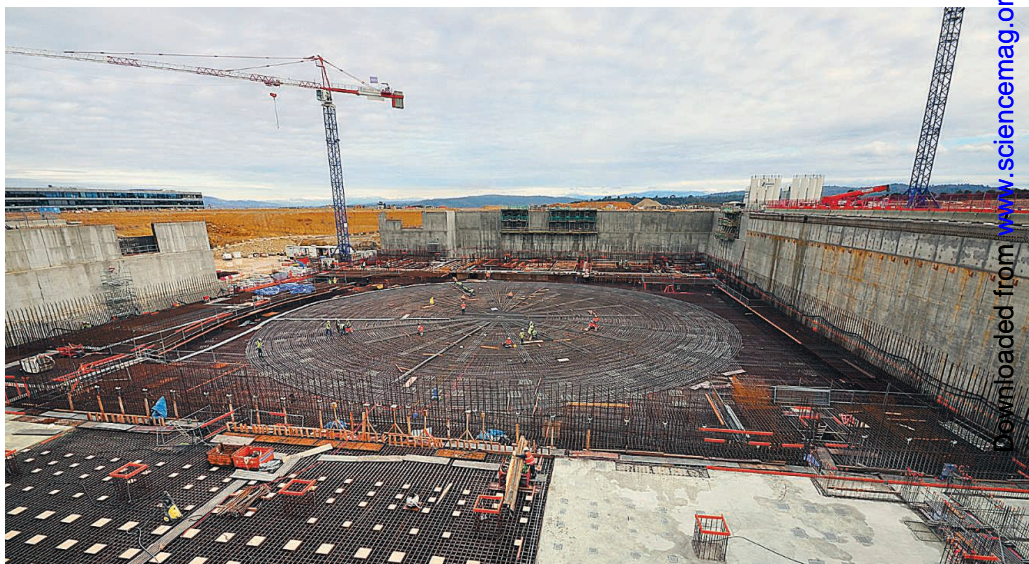
Rock bottom. Work on the circular foundations for the ITER fusion reactor was halted last June following disputes over the design. Construction did not begin again for 8 months.