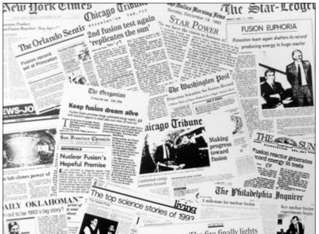
PPPL’s world-record burst of fusion energy on Dec. 9, 1993, made headlines around the world.