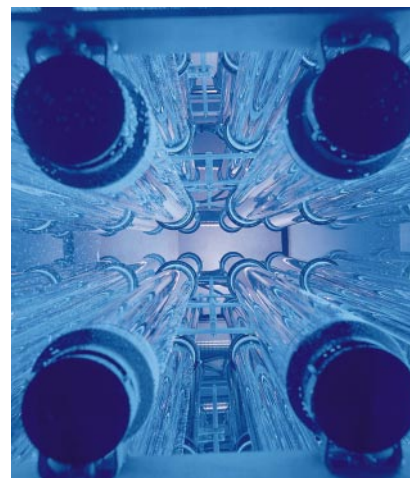
Ozone treatment such as that used on drinking water (above) could strip drugs from sewage.