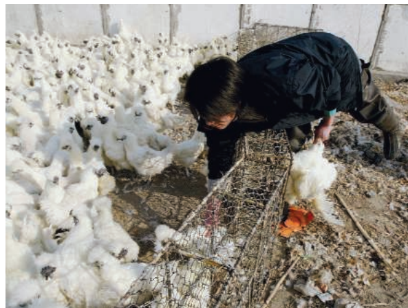
Drug habit. Chinese farmers routinely administered an antiviral drug to poultry, according to a news report.

Vietnam has found another possible case of human-to-human transmission of the H5N1 virus among a total of 10 new cases it reported in a 1-week period—6 weeks or more after they were originally detected. The Ministry of Health officially notified the World Health Organization (WHO) of three new human H5N1 cases on 8 June, but the most recent of those had been detected on 26 April. On 14 June, Vietnam reported three more human cases