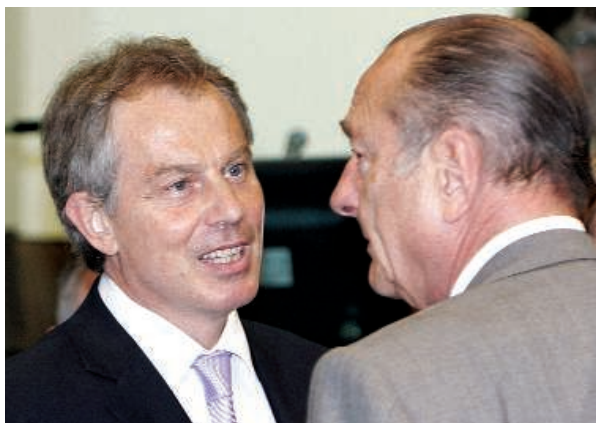
No love lost. Britain's Tony Blair and France's Jacques Chirac disagreed bitterly at last week's summit meeting.