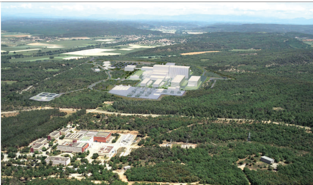
Victorious: Cadarache, in southern France, has been selected to host the ITER fusion project.